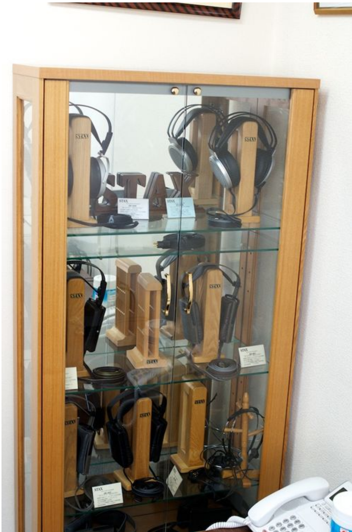
The current range of Stax Earspeakers on display.