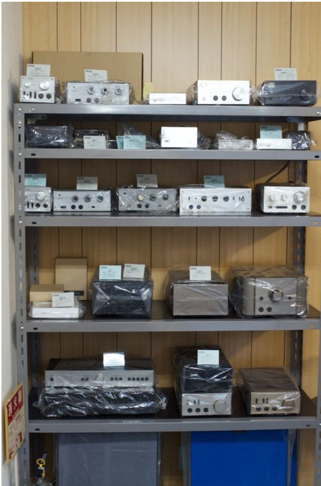
Stax products over the years, including D/A converters such as Talent DAC and the SRM-T2 amplifier on display for visitors.