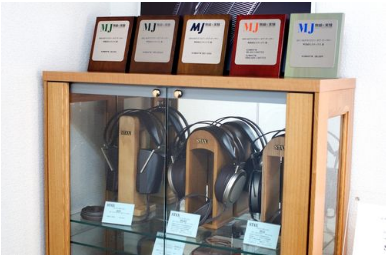
Awards given to Stax and three of their most famous models: The SR-4070, SR-007 "Omega II" and the Omega I.