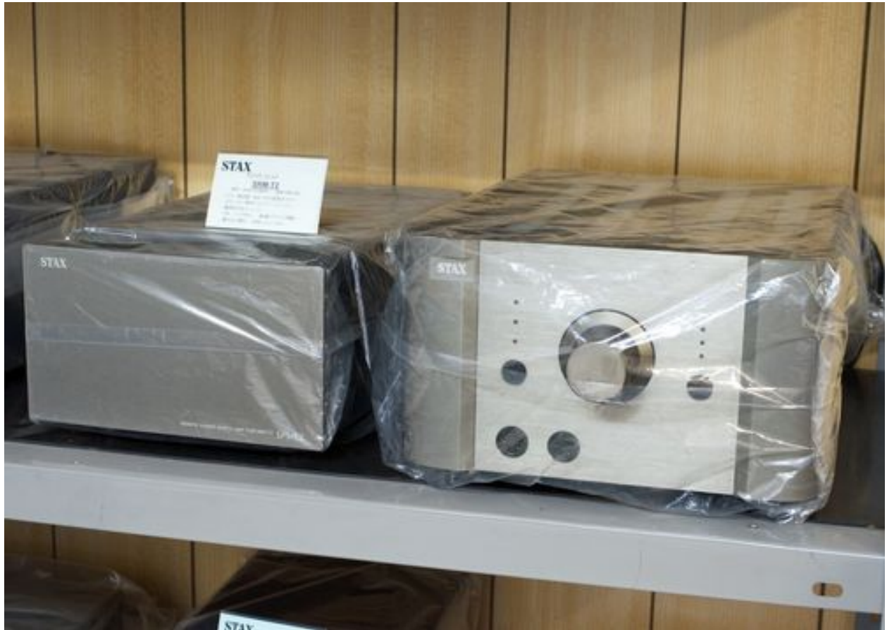
The legendary SRM-T2 amplifier.

shown the shelves where boxed SR-009s are normally stored. There weren't any there.]